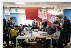
Spaghetti Open Data