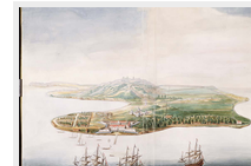
Atlas of Mutual Heritage on...